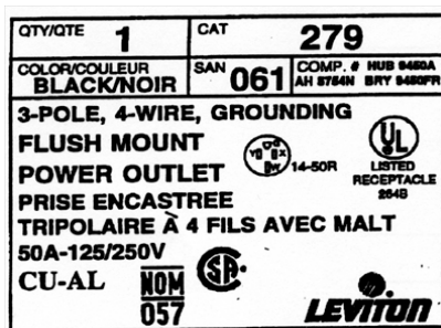
Receptacle Box Label Figure 1

If there are any questions, please do not hesitate to have your electrician call ADI at (503)885-0886.